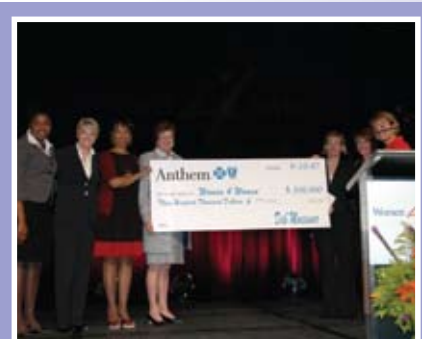
Anthem presents Women 4 Women with $300,000 Fit 4 Me grant